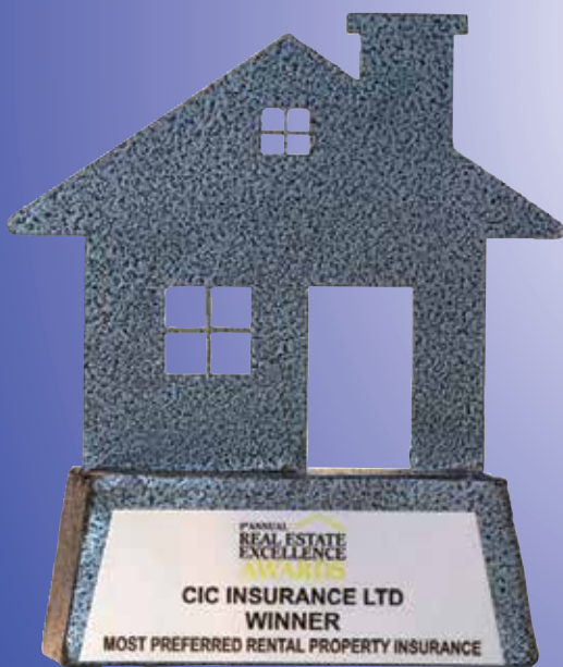
Real Estate Excellence Awards 2019 Winner Most Preferred Rental Property Insurance