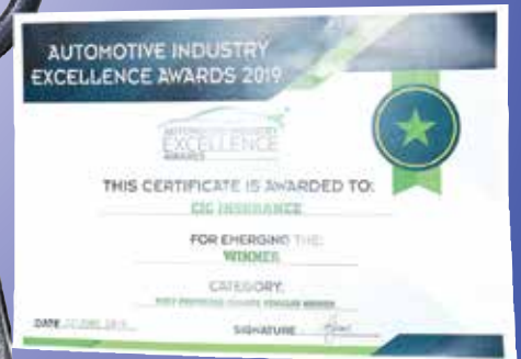
Automotive Industry Excellence Awards 2019 Winner Most Preferred Private Vehicles Insurer